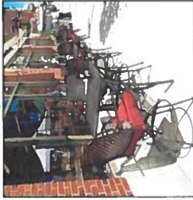
Outdoor dining is arranged to allow a linear 5 foot wide pedestrian clear zone and provides attractive, quality amenities.