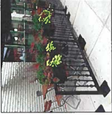
Outdoor dining enclosure utilizes quality materials, creates a sense of privacy with planters, has substantial base plates for stability, and takes up minimal space.