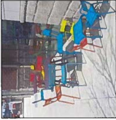
Bright colors provide visual interest and a playful character; seating is also provided for children.