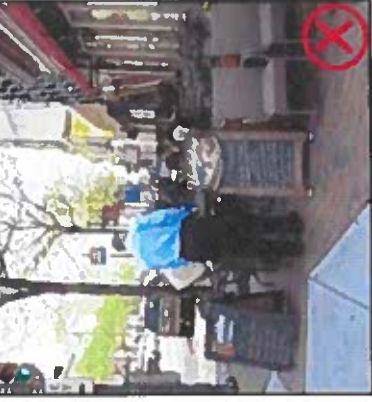
The outdoor dining area blocks the pedestrian clear zone, too many features create visual clutter, and crowding of the dining area detracts from other users.