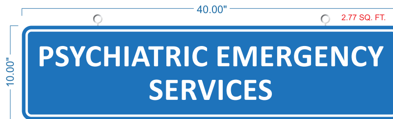
ONE (1) DOUBLE SIDED RIDER - 1" THICK HDU, V-CARVED - PAINTED