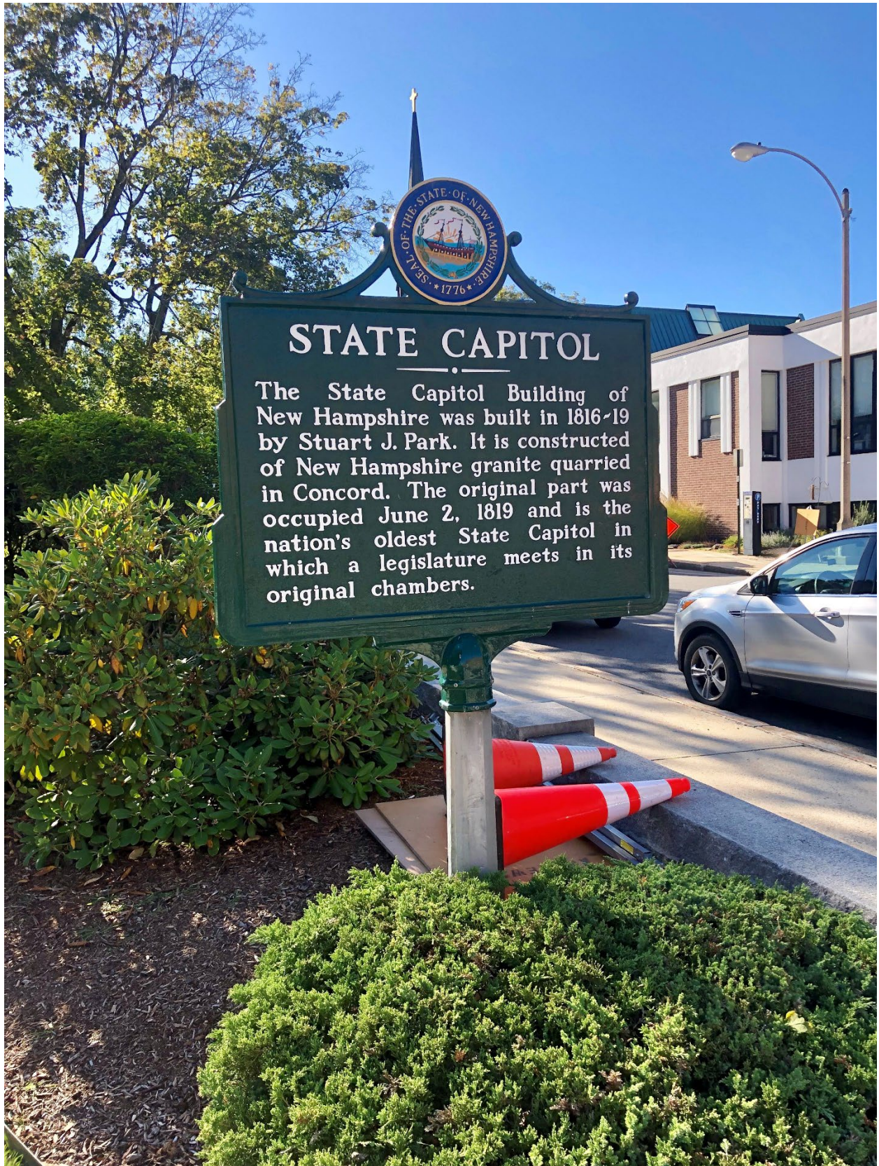
SAMPLE NH HISTORICAL HIGHWAY MARKER